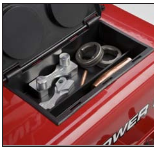
Gun Expendable Parts Compartment