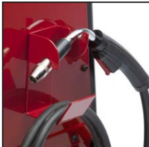
Coil claw Keeps your workstation organized