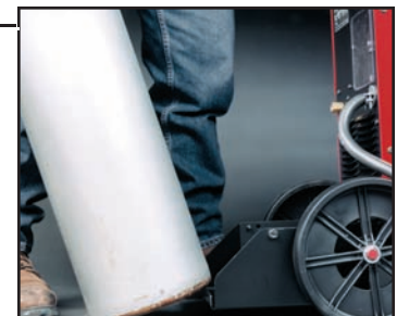
Easy Load Gas Cylinder Platform