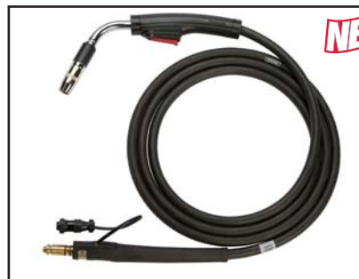
NEW! Magnum PRO 250L Gun With long lasting Copper Plus contact tips