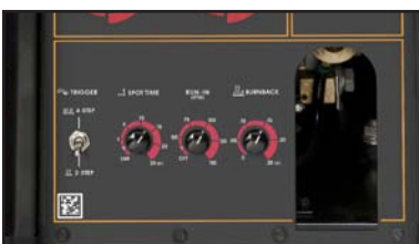
Timer Functions Adds 4-step trigger interlock, spot mode, adjustable run-in speed for smoother arc starting, and adjustable burnback time to minimize wire sticking in puddle.