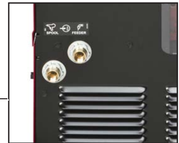
Additional Gas Solenoid – Controls Gas Flow to a Spool Gun