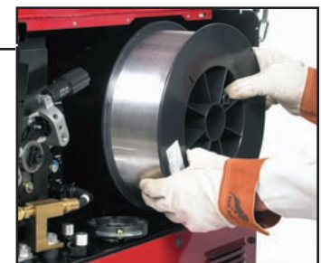
Easy Load Wire Compartment