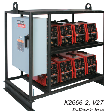
K2666-2, V275-S (Tweco®) 8-Pack Inverter Rack